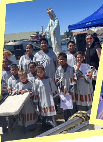
The Young Choristers on the Madonna's boat (above)