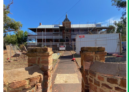
Above: Convent in Northampton still to be repaired fully

Four years on almost to the day that this newsletter article is being composed, we are still waiting for works to be completed on the Sacred Heart Convent in Northampton and for works to commence on Our Lady of Fatima Church in Nanson. It is estimated that when all works are completed, the total Diocesan repair costs will exceed $5 million.